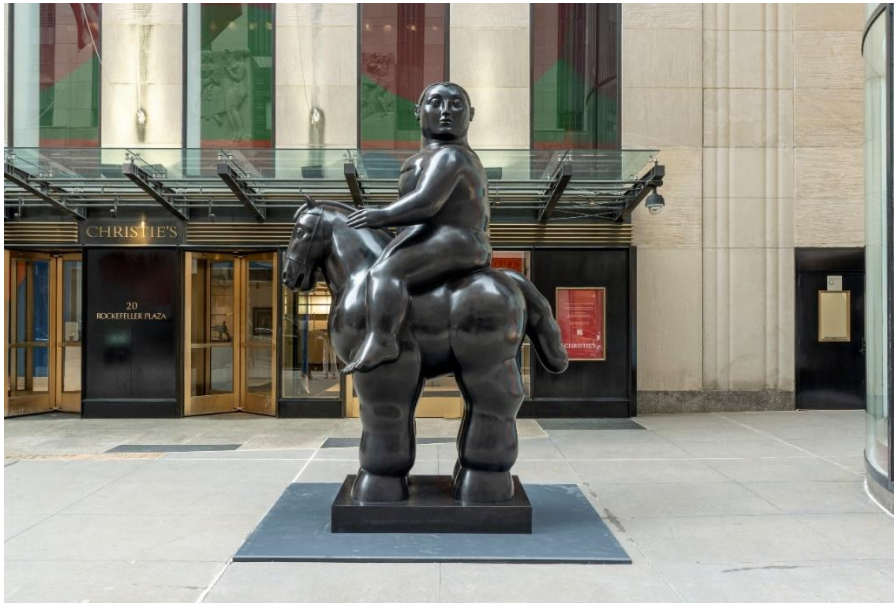
FERNANDO BOTERO (B. 1932)

8 NEW AUCTION RECORDS, INCLUDING FERNANDO BOTERO AND TOMÁS SÁNCHEZ